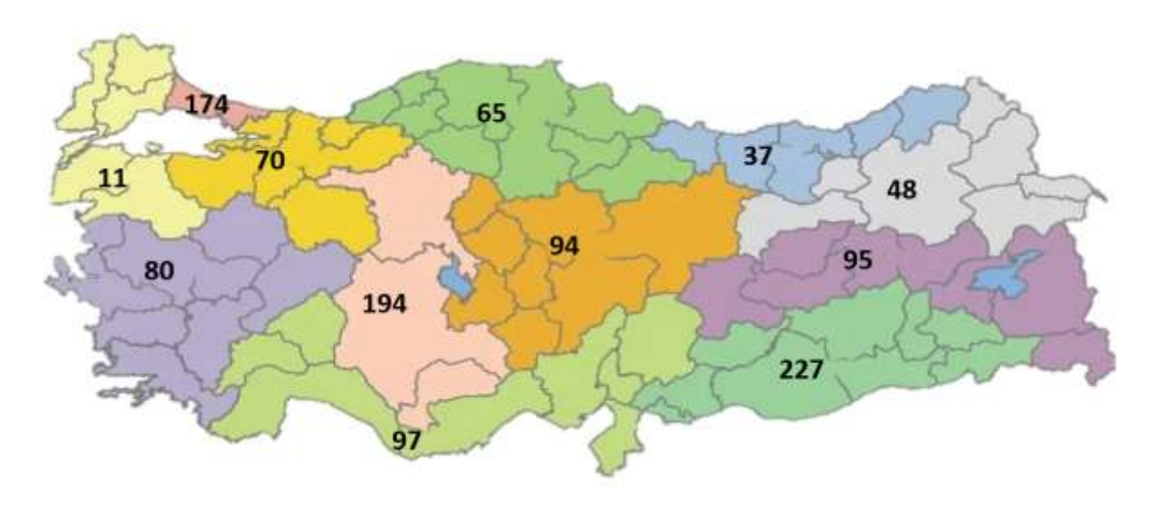
Figure 1: Number of New COVID-19 Patients by NUTS-1, Turkey