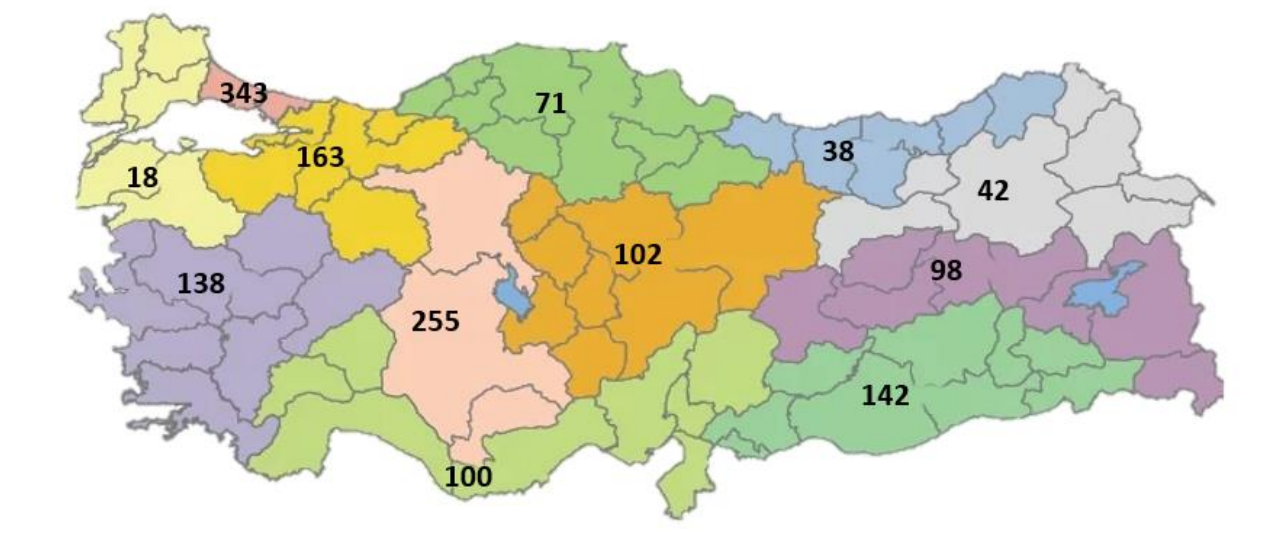
Figure 1: Number of New COVID-19 Patients by NUTS-1, Turkey