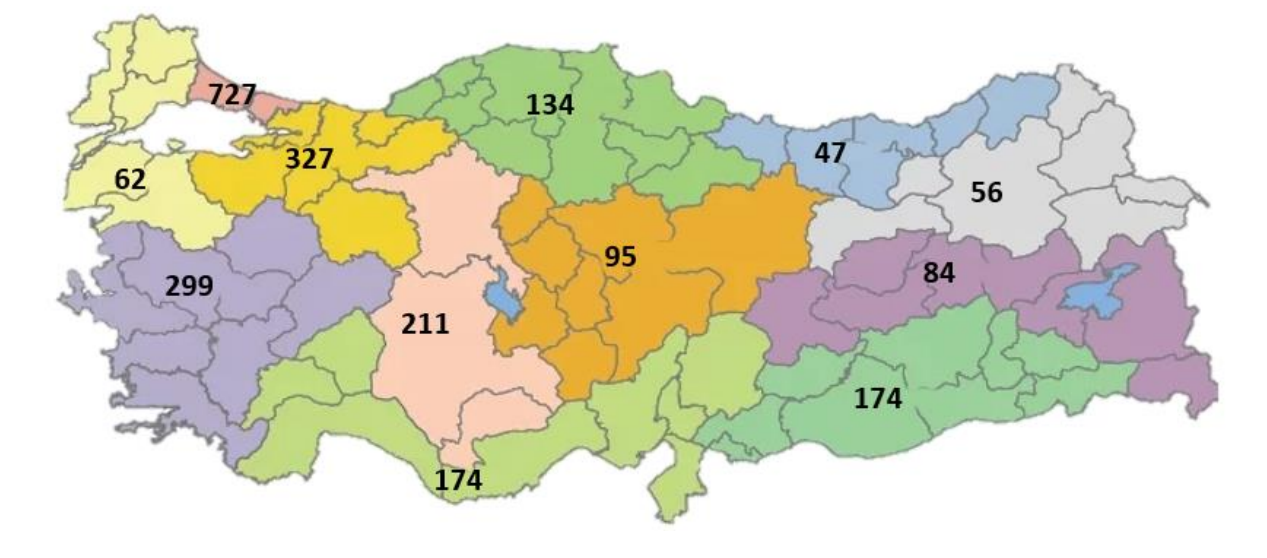
Figure 1: Number of New COVID-19 Patients by NUTS-1, Turkey