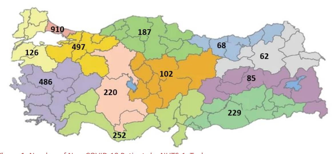
Figure 1: Number of New COVID-19 Patients by NUTS-1, Turkey