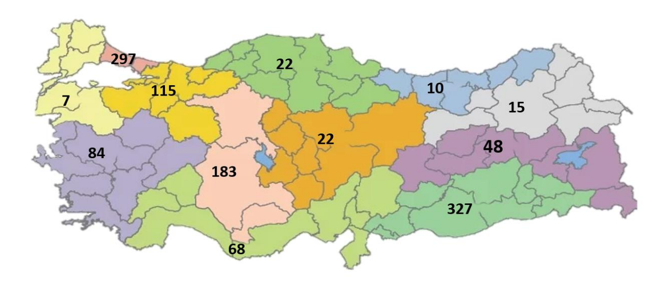
Figure 1: Number of New COVID-19 Cases by NUTS-1, Turkey