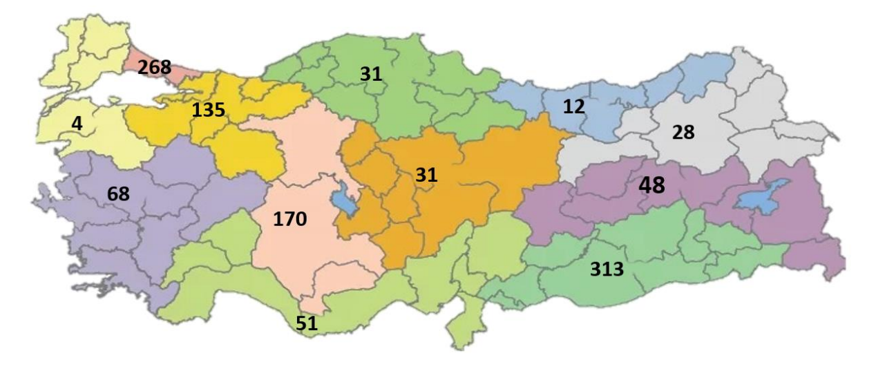
Figure 1: Number of New COVID-19 Cases by NUTS-1, Turkey