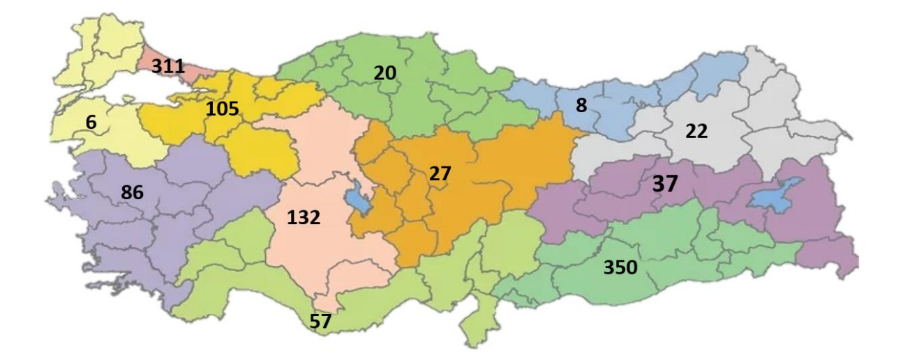
Figure 1: Number of New COVID-19 Cases by NUTS-1, Turkey