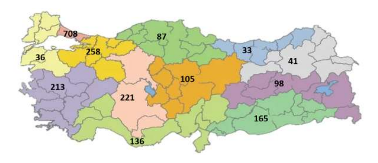
Figure 1: Number of New COVID-19 Patients by NUTS-1, Turkey