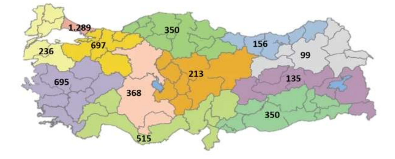
Figure 1: Number of New COVID-19 Patients by NUTS-1, Turkey