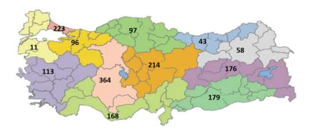
Figure 1: Number of New COVID-19 Patients by NUTS-1, Turkey