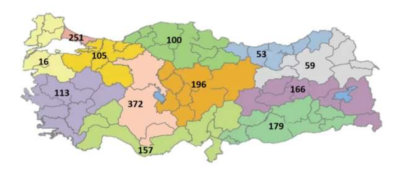
Figure 1: Number of New COVID-19 Patients by NUTS-1, Turkey