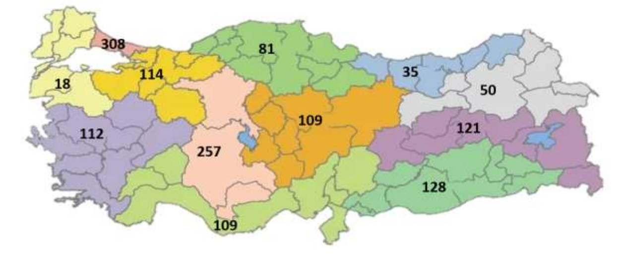
Figure 1: Number of New COVID-19 Patients by NUTS-1, Turkey