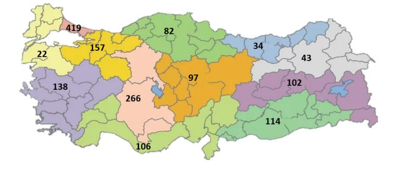
Figure 1: Number of New COVID-19 Patients by NUTS-1, Turkey