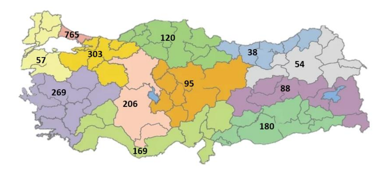
Figure 1: Number of New COVID-19 Patients by NUTS-1, Turkey